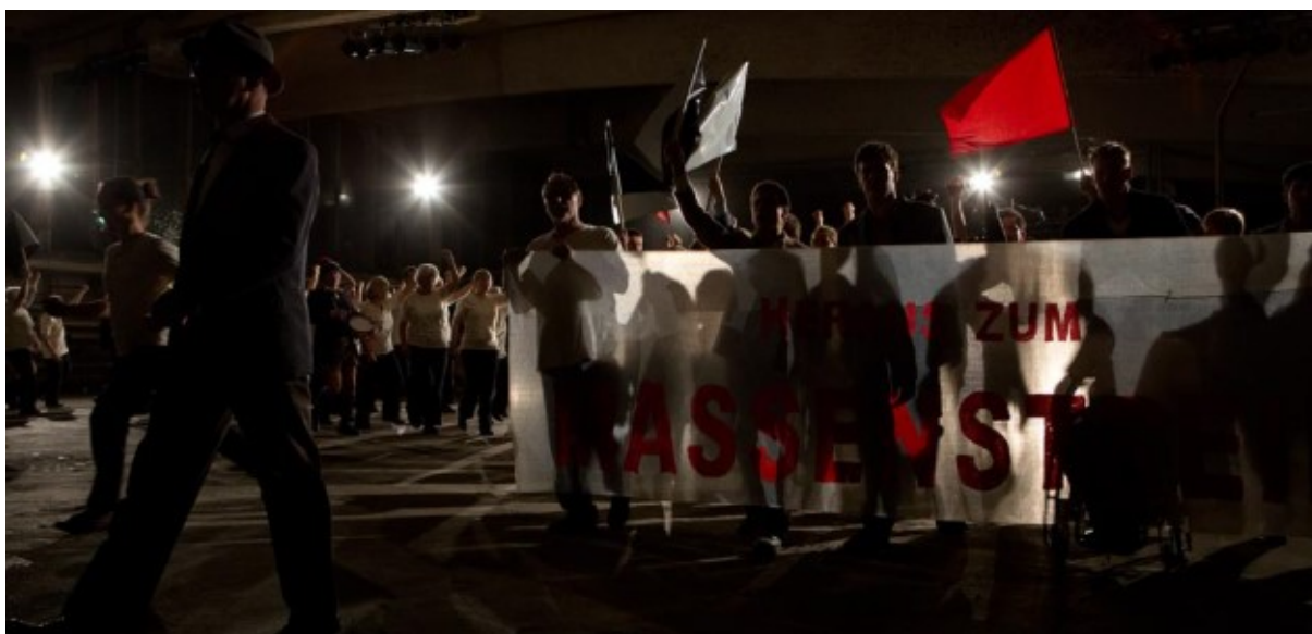
Image 3: Play of the Lindenhof Theater