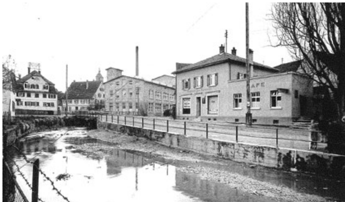
Image 2: Pausa factory and restaurant Zum Schwanen